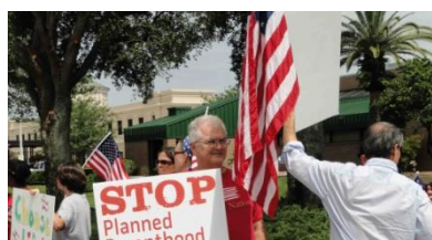
Last Day – Kissimmee stands strong!