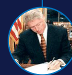
President Bill Clinton signs "Don't Ask, Don't Tell"