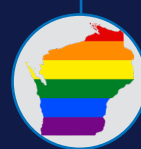
Wisconsin becomes the first state to outlaw discrimination based on sexual orientation