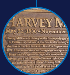
Rainbow flag, designed by Gilbert Baker, debuts. Harvey Milk elected as San Francisco Supervisor and assassinated in the same year