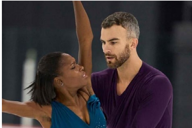
CANADIAN FIGURE SKATER ERIC RADFORD (RIGHT) WITH PAIRS SKATING PARTNER VANESSA JAMES