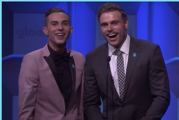
US FIGURE SKATER ADAM RIPPON (LEFT) AND BRITISH-AMERICAN FREESTYLE SKIIER GUS KENWORTHY (RIGHT) AT THE 29TH ANNUAL GLAAD MEDIA AWARDS IN 2018