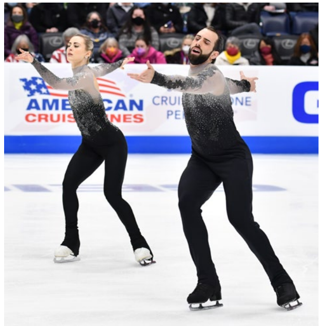
US FIGURE SKATER TIMOTHY LEDUC AND THEIR SKATING PARTNER ASHLEY CAIN-GRIBBLE

is a 2019 US Champion and 2019 World Team Trophy champion alongside figure skating partner Ashley Cain-Gribble. LeDuc is an out gay and nonbinary figure skater. They were the first out LGBTQ athlete to win the national pairs title in 2019. Named to Team USA on January 9, LeDuc will be the first out nonbinary Winter Olympian. The Games will also feature a milestone for nonbinary visibility, as Timothy LeDuc competes as a nonbinary Winter Olympian.