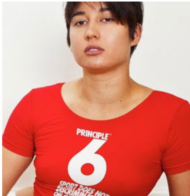
AUSTRALIAN SNOWBOARDER BELLE BROCKHOFF FOR THE PRINCIPLE SIX CAMPAIGN, A 2014 OLYMPIC PROTEST OF RUSSIAN ANTI-GAY LAWS DURING THE SOCHI WINTER GAMES

is a two-time Olympian and has represented Australia at the FIS Snowboarding World Championships as well. She made her Olympic debut at the 2014 Sochi Games and competed in the 2018 Pyeongchang Games. Brockhoff has been very involved in LGBTQ advocacy and publicly came out prior to the 2014 Sochi Games as part of a protest against anti-LGBTQ laws in Russia.