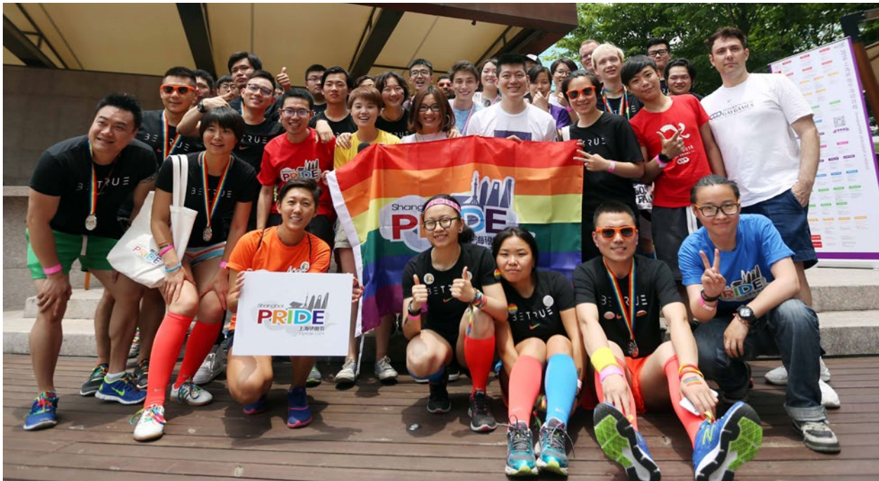
OUTCHINA MEMBERS AND ORGANIZERS AT A SHANGHAI LGBTQ PRIDE EVENT, COURTESY OF OUTCHINA.

Over concern about government backlash, the LGBTQ organizations that GLAAD is connected with expressed a desire to not be published or publicized in this guide. GLAAD may be able to put you in direct contact with individual advocates. Some may be comfortable speaking to the media off the record, however, reporters will need to exercise caution with LGBTQ sources in China.