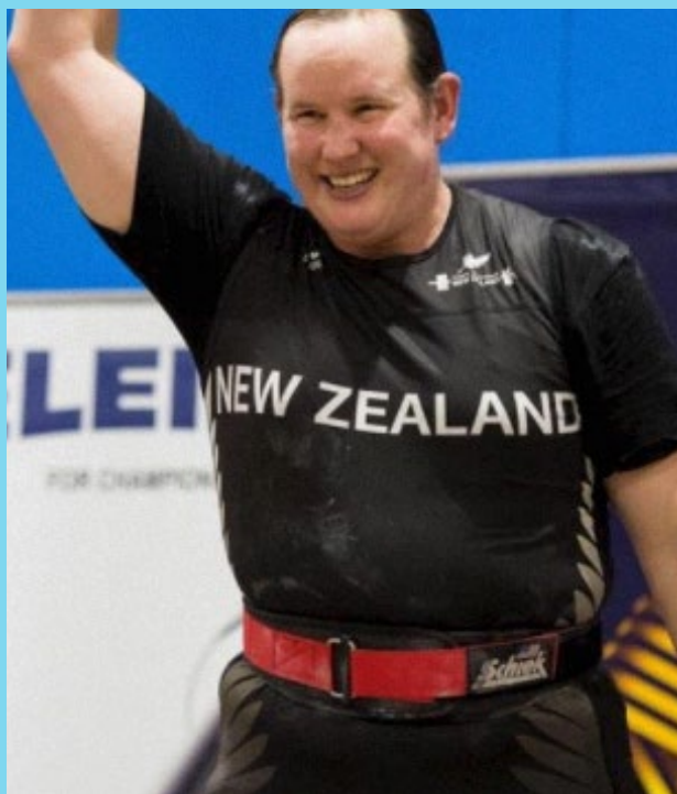
NEW ZEALAND WEIGHTLIFTER LAUREL HUBBARD