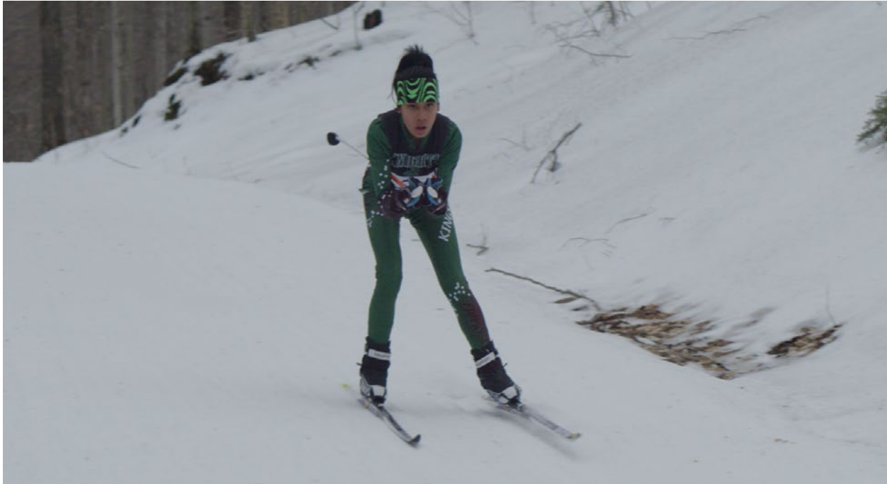
HULU ORIGINAL DOCUMENTARY CHANGING THE GAME

naturally occurring levels of testosterone; Semenya has refused to take medication to suppress her hormone levels, and has challenged the policy—which she and other global human rights experts call discriminatory—in two court cases at the European Court of Human Rights. 42