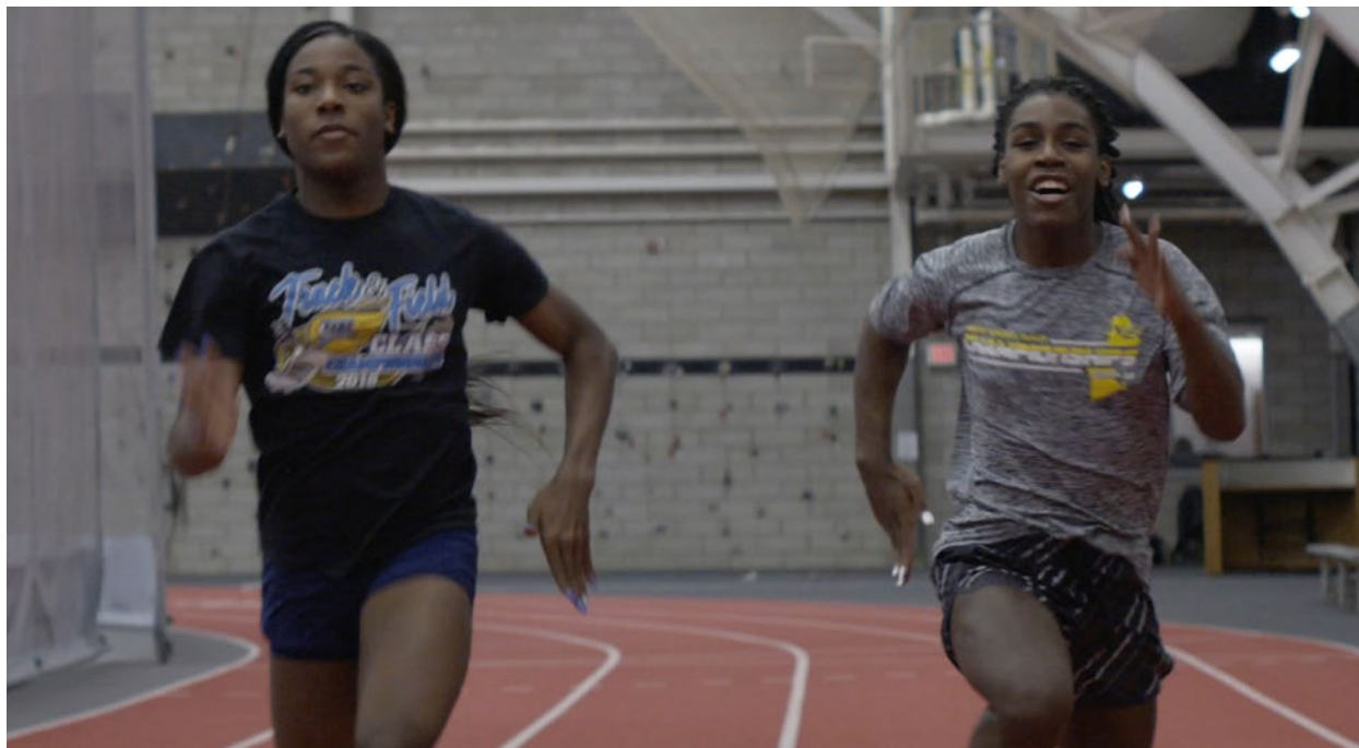
HULU ORIGINAL DOCUMENTARY CHANGING THE GAME

In the United States, a number of anti-LGBTQ activist groups have spent many years fighting against LGBTQ equality and have recently put enormous resources into attacking the transgender community, especially trans youth. In years past, these organizations focused on trying to keep LGBTQ couples from gaining marriage rights, fighting bans on conversion therapy, and enacting laws that prevent teachers from speaking about LGBTQ people in schools, for example. In the period between 2015-2018, these activist groups focused on trying to prevent trans youth from accessing restrooms and locker rooms at school. Anti-LGBTQ organizations have largely lost most of these battles, but they continue to draft model legislation, fight against LGBTQ rights in the courts, and promote misinformation on social media and in right-wing media.