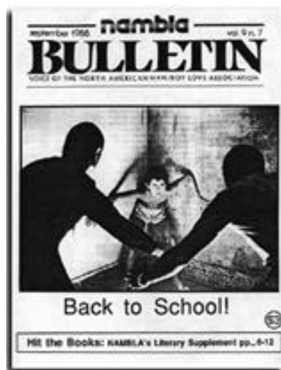
The September 1988 issue of NAMBLA Bulletin , Vol. 9, No. 7, shows two men cornering a young child.

On the other hand, the North American Man-Boy Love Association (NAMBLA), which advocates sex between men and boys, hails the study on its web-site in "The Good News About Man/Boy Love." "NAMBLA states, "Sex does not pose the danger to minors claimed by police, prosecutors and prudes crusading against man/boy love." 43